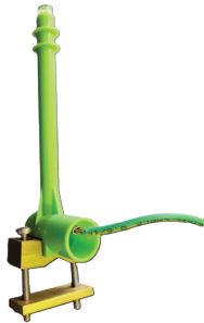
1 X BOND POINT